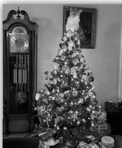
Right: Christmas Tree at the Mother House.