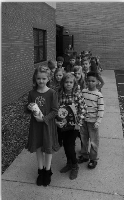
Left: Children from Owensboro Catholic K-3 waiting to give us their gifts.